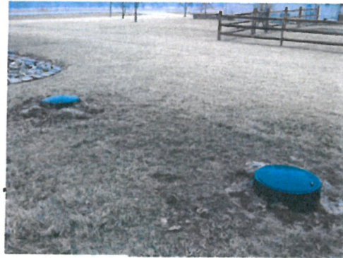
New Risers on Existing Tank