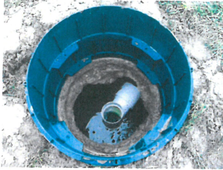
New Outlet Riser w/ New 4 Baffle