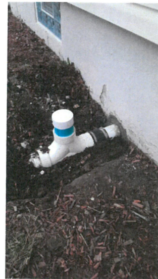
New Exterior Clean-Out