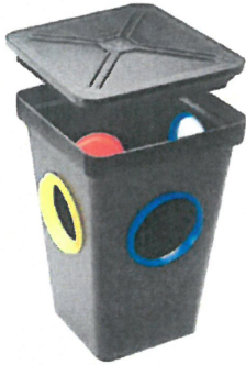
PVC Distribution Box