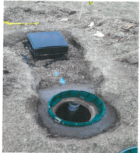
New baffles & risers installed on an existing tank (both inlet & outlet shown)