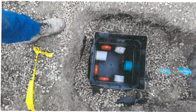
New Distribution Box